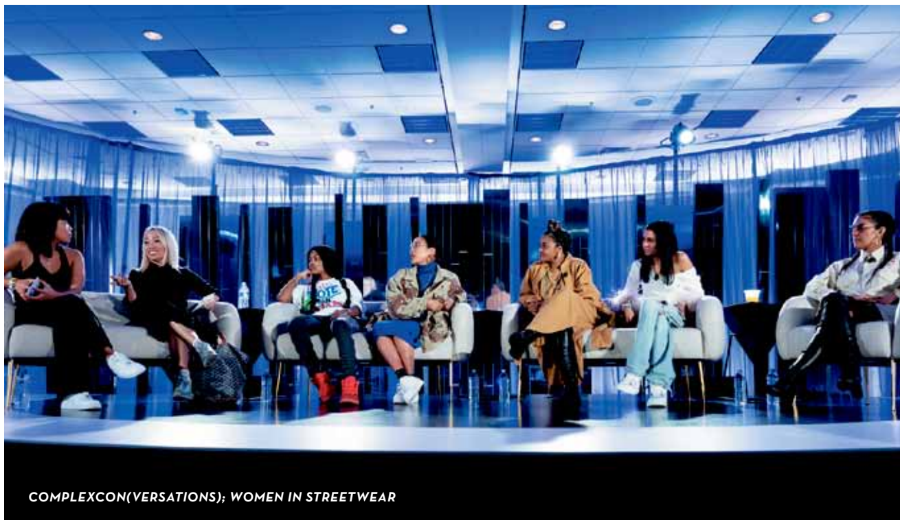
COMPLEXCON(VERSATIONS); WOMEN IN STREETWEAR

On Day 1, Vince Staples with a Long Beach Legend at 2 p.m. had two LBC natives, Vince Staples and Snoop Dogg, go head to head: question for question, statement for statement. As always, the panels quickly sold out of seats, leaving standing room only. Regardless, the attention to detail was