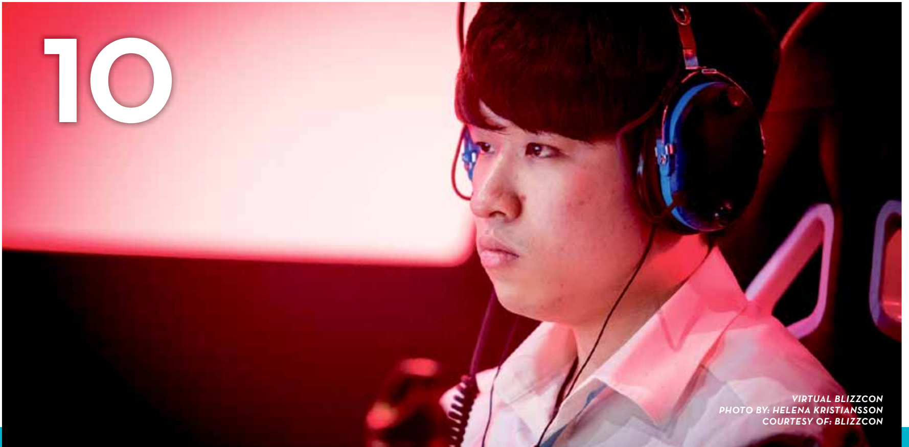
VIRTUAL BLIZZCON