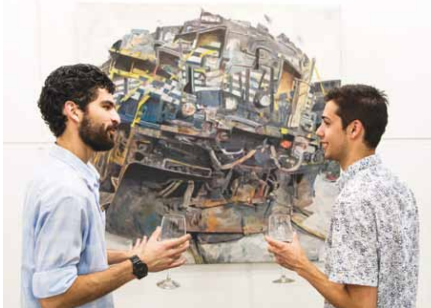
ART BY: TRAVIS GRANT