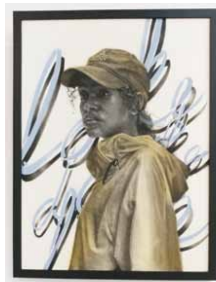
ART BY: JAMES THISTLETHWAITE

sense of adventure in a desolate space or place. Much like the WorkWell space itself, Thistlethwaite's work is sterile, hypnotic, and familiar all at once. His subjects feel dramatic, his backgrounds or settings - when present - feel post-apocalyptic or juxtaposed against the casual