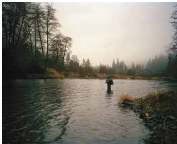
ART BY: OLIVIA ELLA