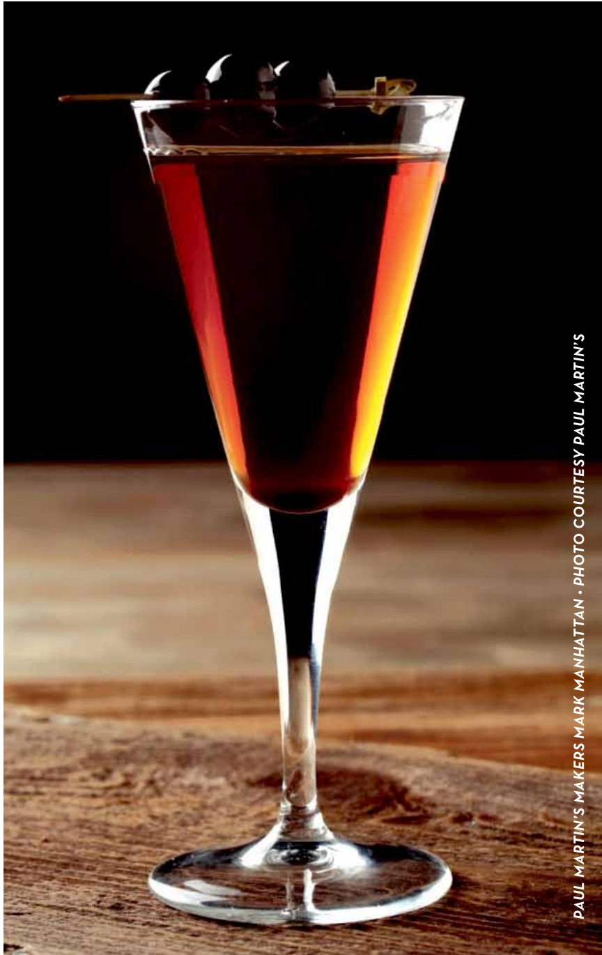
PAUL MARTIN'S MAKERS MARK MANHATTAN

big city atmosphere but are currently situated in Irvine, Tokyo Table is a great spot for you. This large Japanese restaurant and bar is constantly full of loud and happy people chowing down on delicious Japanese cuisine and sipping away on unique craft cocktails. Celebrating their 10th anniversary this year, Tokyo Table offers a huge menu of cocktails including many easy-drink-