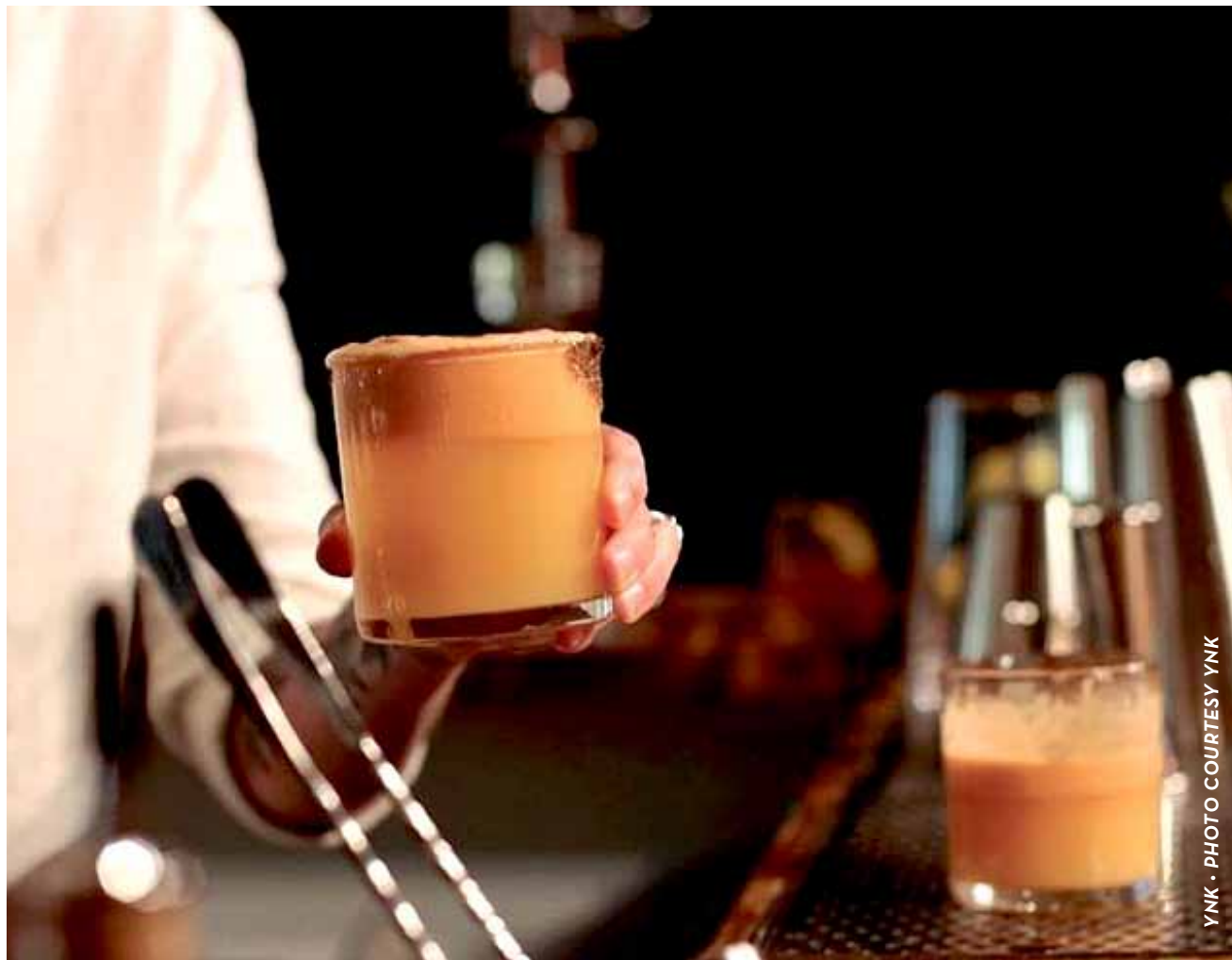
YNK - PHOTO COURTESY YNK