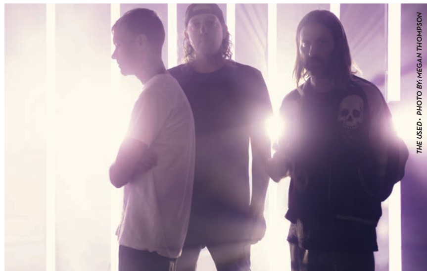
THE USED

What’s not allowed? Bad vibes and bad attitudes. Tickets start at $24.99 and can be purchased via Live Nation. Doors open at 1:30 p.m. with no re-entry. Meet & Greet packages are available too.