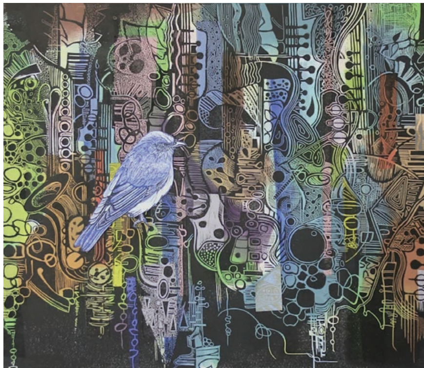
SOUND TRIP BY HORIHO URIU

this vision, he shoots majestic waves from the shorelines of local surfing spots, including Laguna Beach and The Wedge Newport Beach, featured in the 1964 film, The Endless Summer .