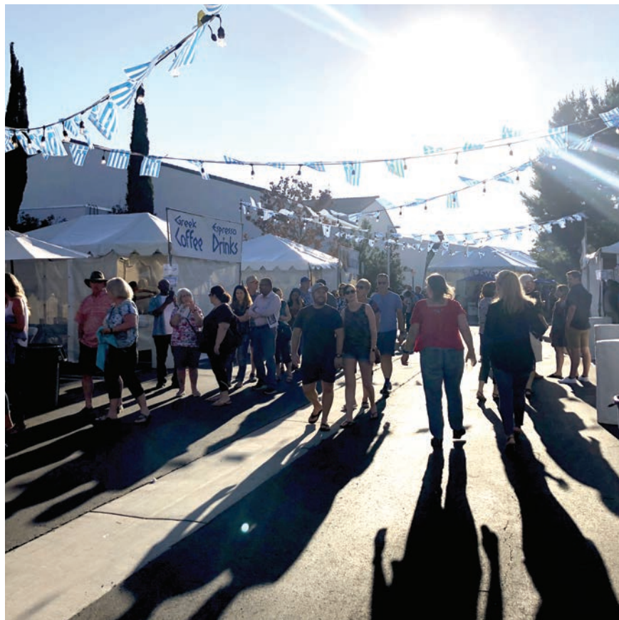
PEOPLE AT THE 41ST ANNUAL GREEK FESTIVAL

the festival, he has this way of explaining the appeal of this and similar cultural events. He compared it to returning to one's homeland; "It's [getting to see] the way that people dance, the way they eat, the way they enjoy life. When you see the culture come to life, it's like seeing the country appear in front of your eyes."