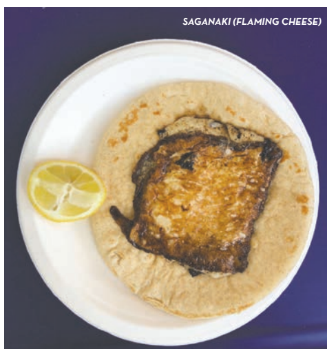
SAGANAKI (FLAMING CHEESE)

Reading that this would be "fried Greek cheese flamed in brandy" only made it more appealing, and watching the cheese crisp up and erupt in alcoholic flames was one of the most enticing things I'd seen in a while.