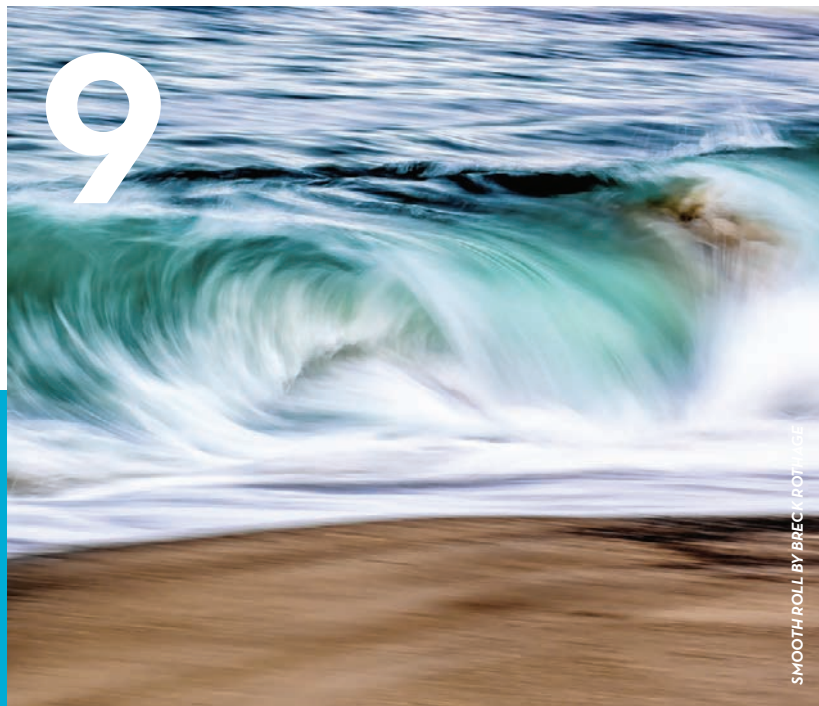
SMOOTH ROLL BY BRECK ROTUNGE