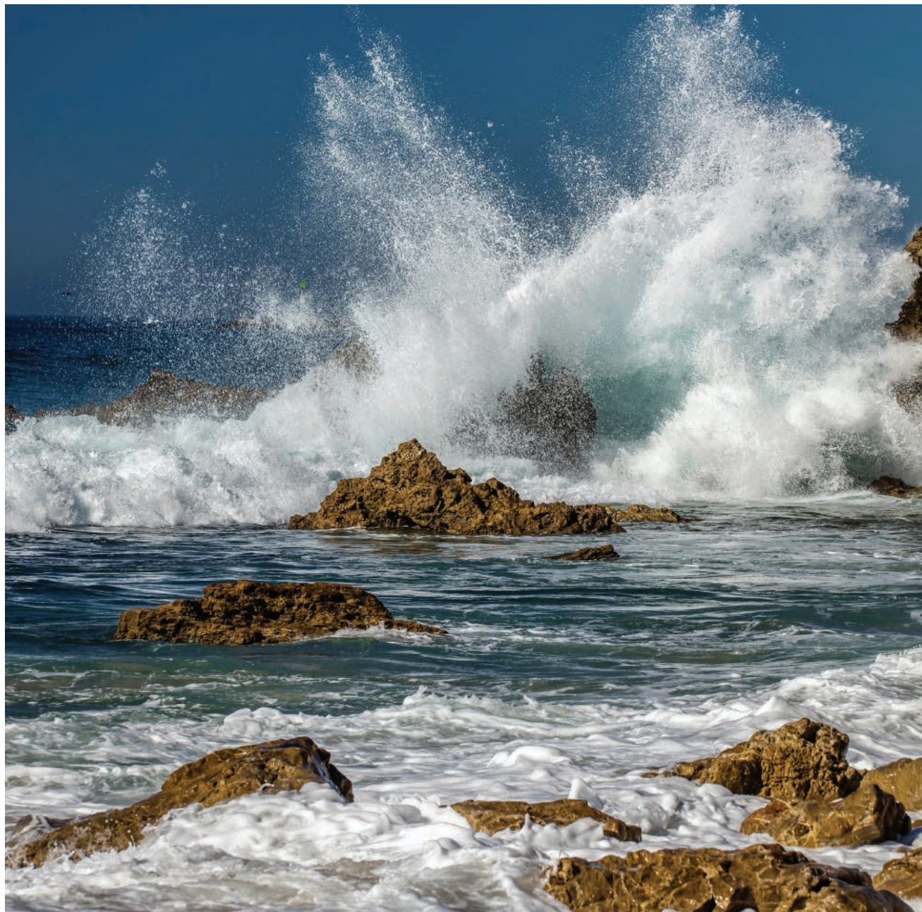
SALT SHAKER BY BRECK ROTHAGE