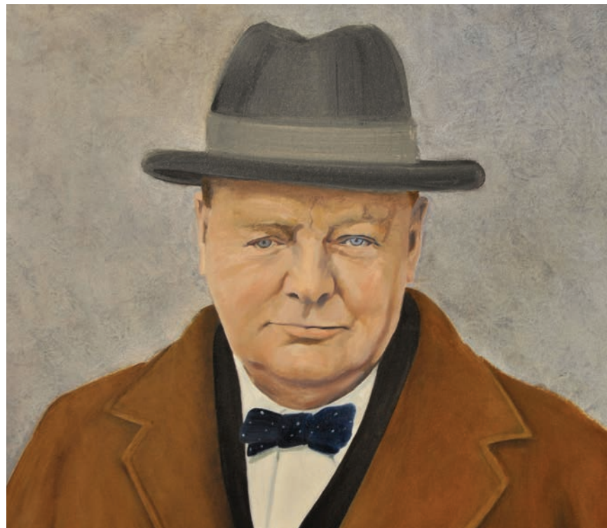
WINSTON CHURCHILL BY DENNIS CARRIE

Carrie's subjects for his oil paintings are often portraits of historical figures.