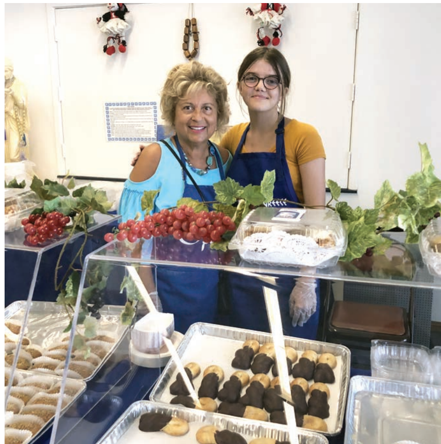
VOLUNTEERS POSING WITH HOMEMADE PASTRIES

After we shared a cup of wine (their treat to me), I ventured off on my final mission: dessert. I made a beeline to the room where they had all the pastries