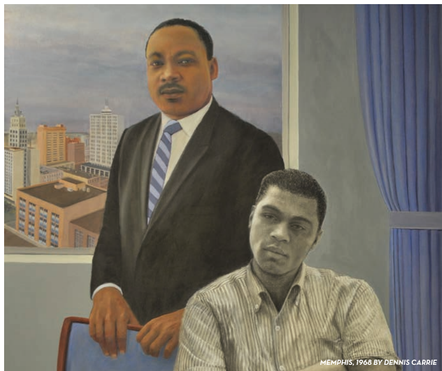
MEMPHIS, 1968 BY DENNIS CARRIE

This year, the Laguna Beach Festival of Arts hosts 140 artists, exhibiting more than 1,000 pieces of fine art, including paintings, sculpture, photography, printmaking, ceramics, glass, furniture and jewelry. The outdoor festival at 650 Laguna Canyon Road, Laguna Beach is open daily July 5 to August 31, weekdays from noon to 11:30 p.m. and weekends, 10 a.m. to 11:30 p.m. (949) 494-1145, LagunaFestivalofArts.org .