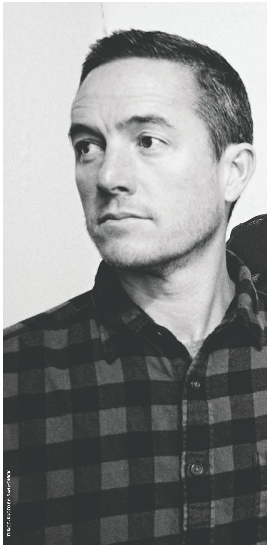
THRICE • PHOTO BY DAN MONICK