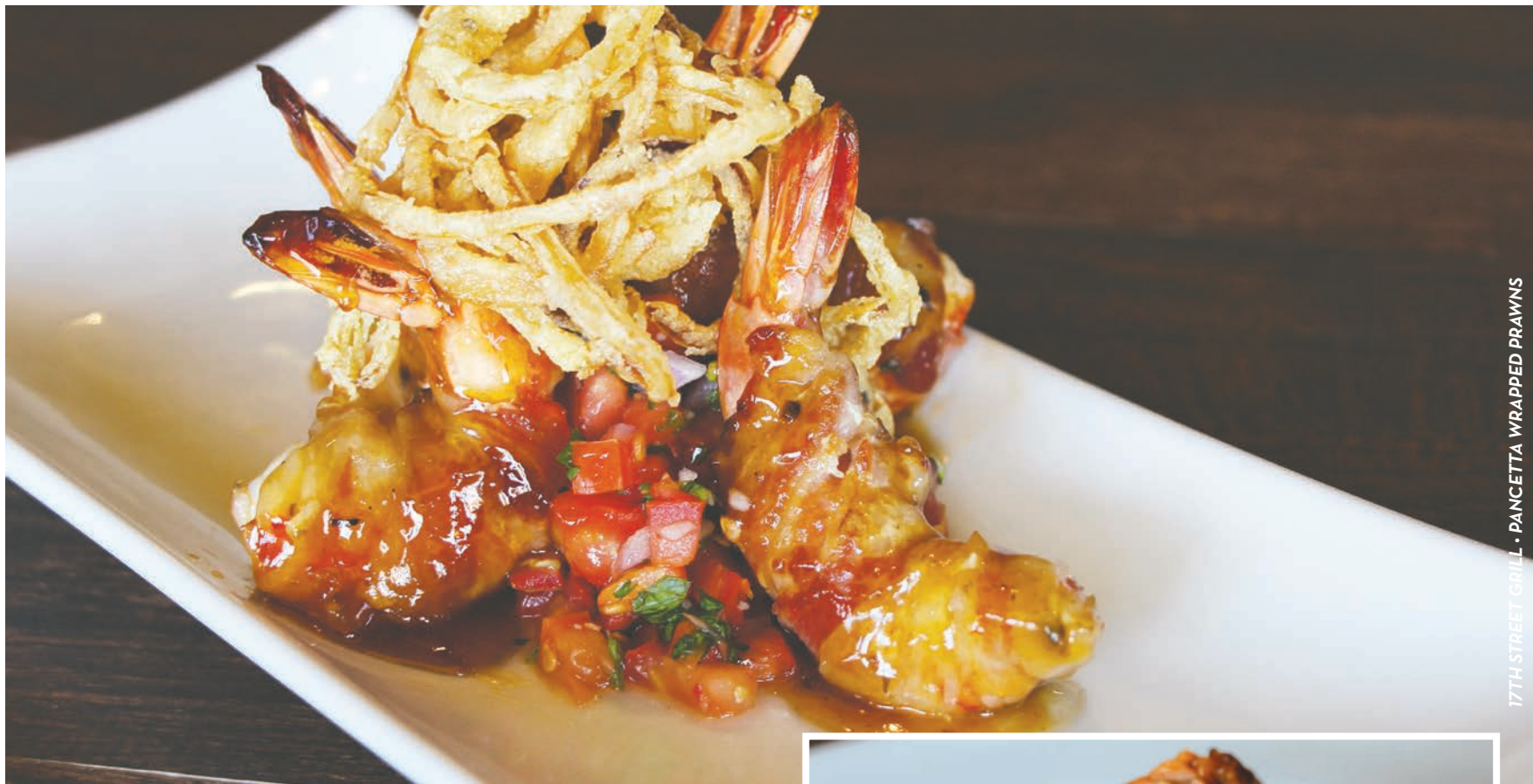
17TH STREET GRILL • PANCETTA WRAPPED PRAWNS