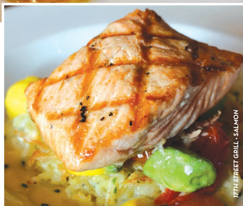
17TH STREET GRILL • SALMON

If the food isn't enough, members of the community may be intrigued to try out the drinks. Five Crowns has featured