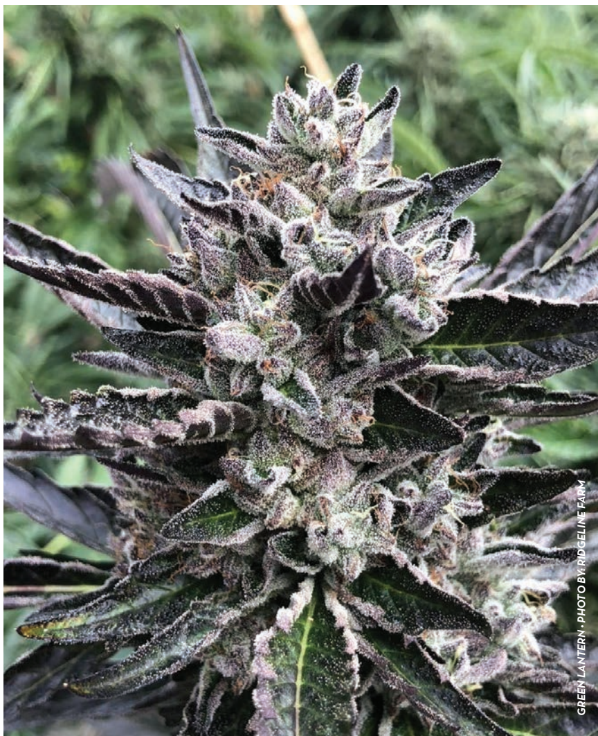
GREEN LANTERN

Originally bred by the team at DNA genetics, the primo cultivators over at 710 Labs propagated over 30 seeds on the hunt for their winner, and you can see the effort in the results. Much of the time when you hear 710 Labs' name, you're probably thinking there are some great concentrates on deck. Nevertheless, their flower game is also on point and has become more prevalent since the legal market opened with this cross of Strawberry Banana and Kosher Kush. You'll get a lot of the flavor that earned Strawberry Banana ton of awards, with a bit of extra kick provided by the Kosher Kush.