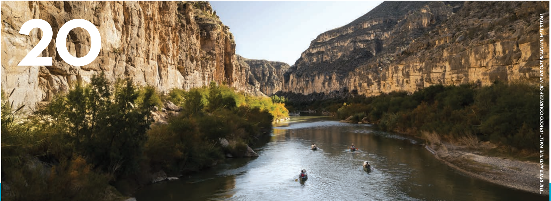
“THE RIVER AND THE WALL”