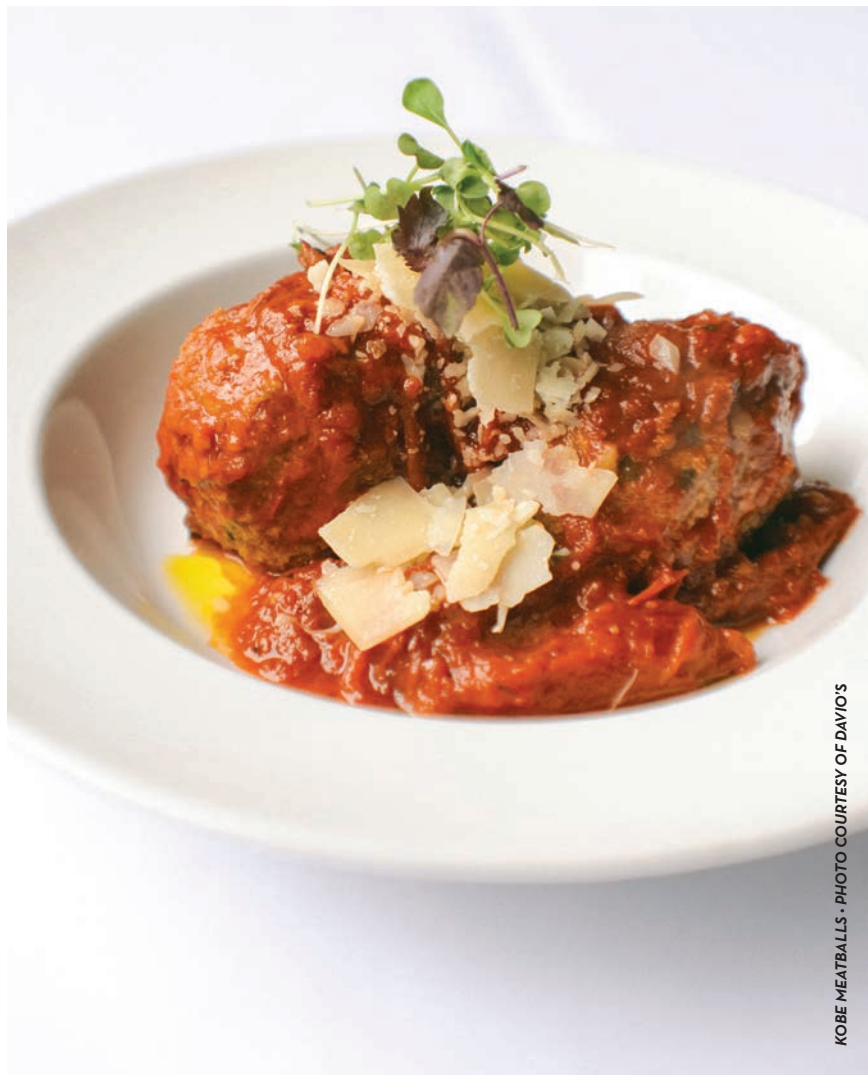
ROBE MEATBALLS

During happy hour, which is 4 - 7 p.m. Monday-Friday and 5 - 7 p.m. Saturday and Sunday, American Kobe Beef Meatball Sliders are available for $9 on the Bar Bites menu. No matter if you get the Kobe meatball from the traditional menu, as a $100 meatball or in a slider, it's a unique dish that's so scrumptious, it's definitely worth the drive from L.A. to Irvine.