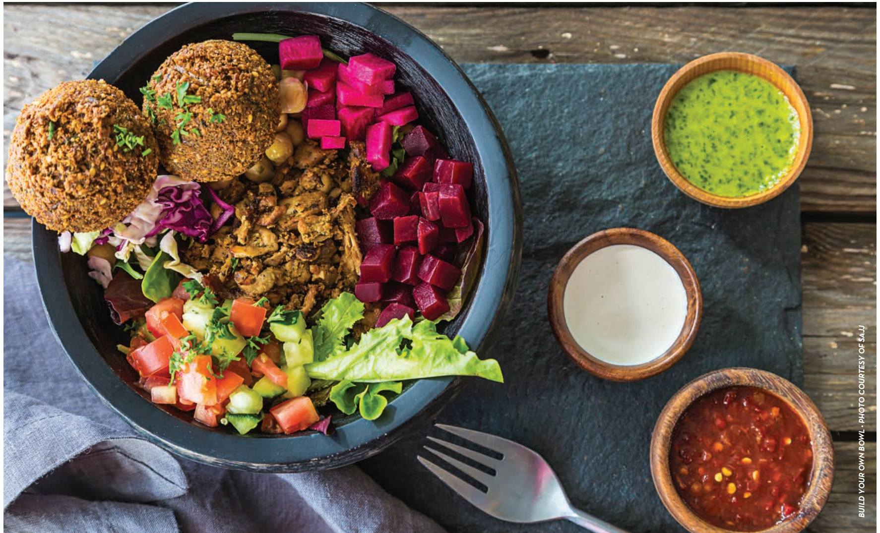
BUILD YOUR OWN BOWL