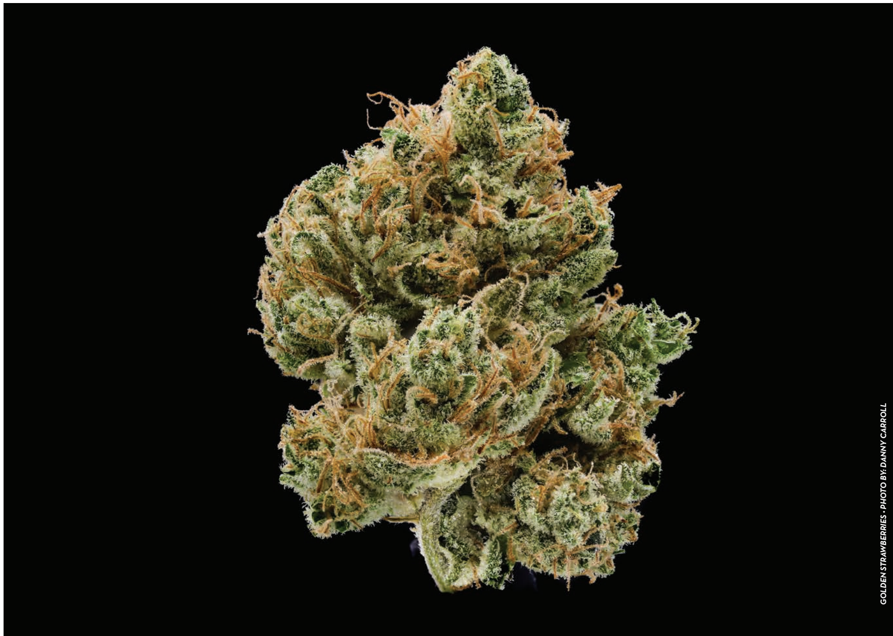
GOLDEN STRAWBERRIES