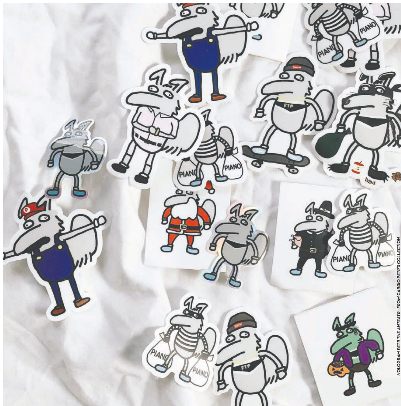
HOLOGRAM PETR THE ANTEATR - FROM CARDIO PETR'S COLLECTION