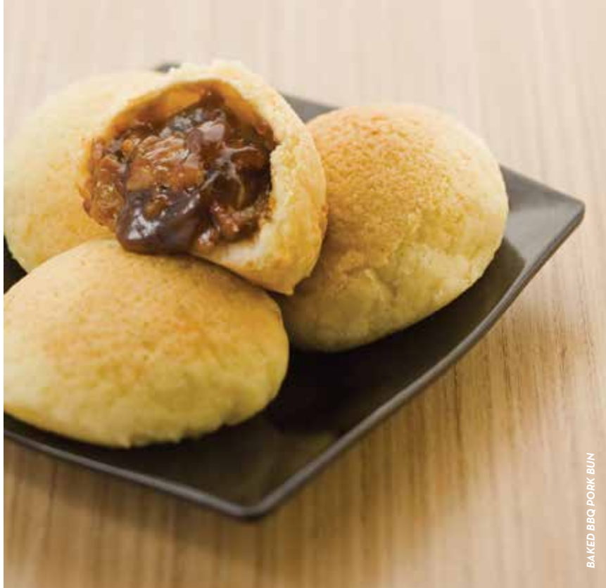
BAKED BBQ PORK BUN