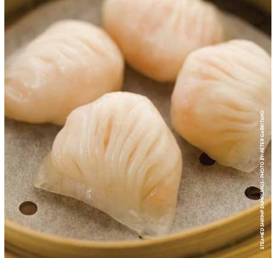
STEAMED SHRIMP DUMPLINGS - PHOTO BY: PETER GARRITANO