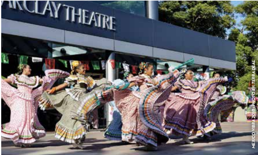
MEXICO VIBRA, 2018.