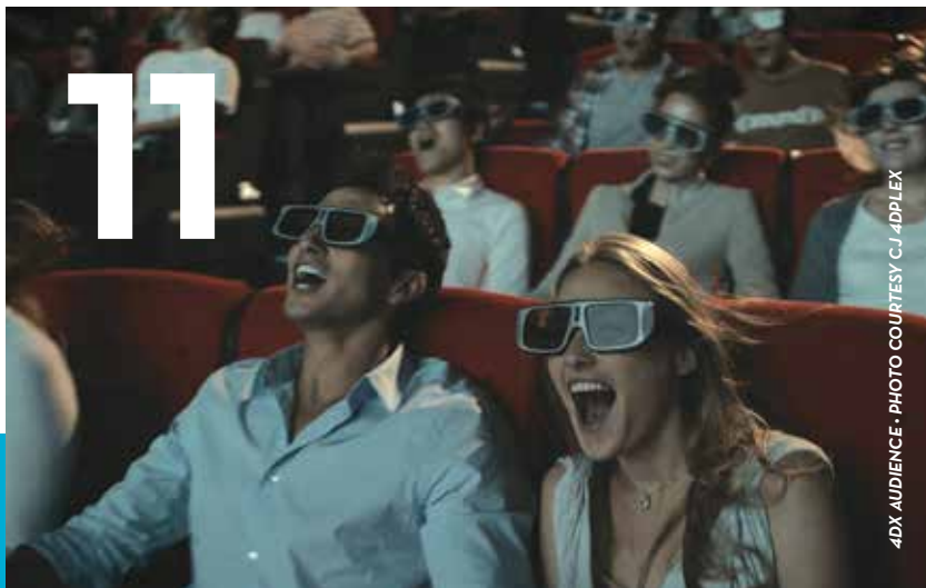
4DX AUDIENCE