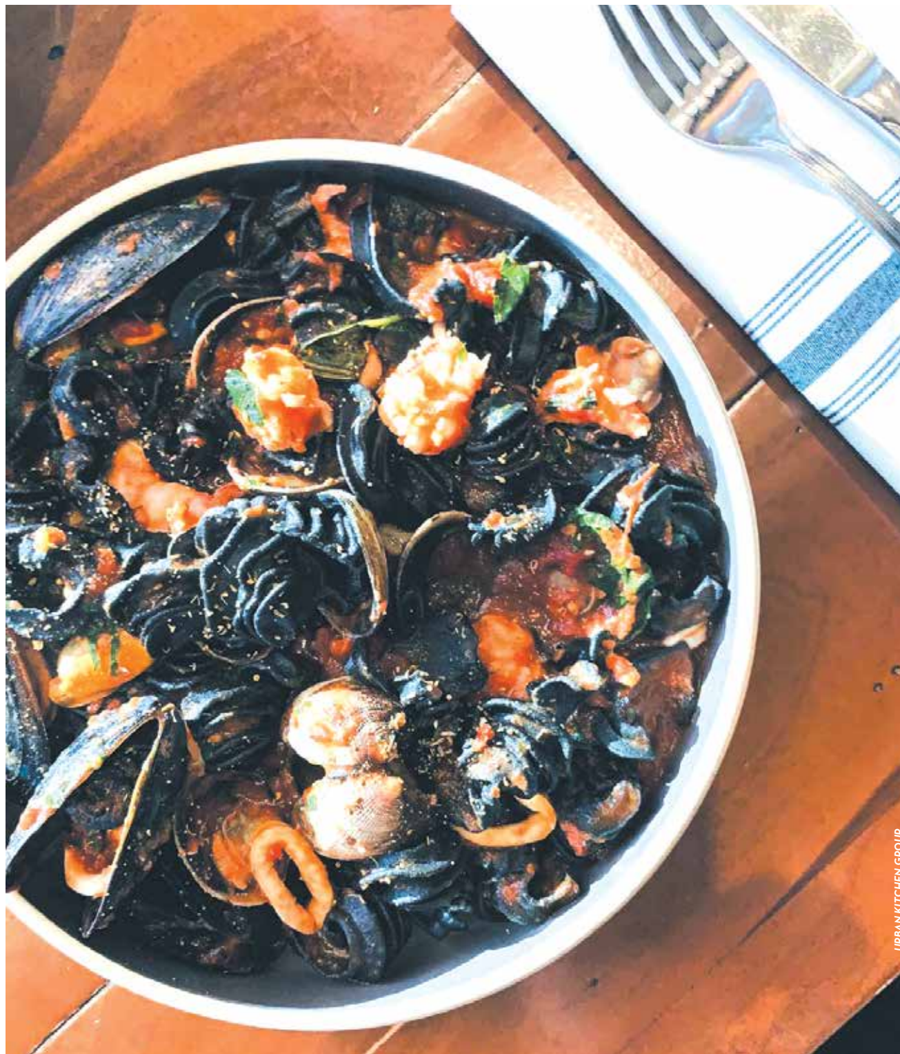
URBAN KITCHEN GROUP