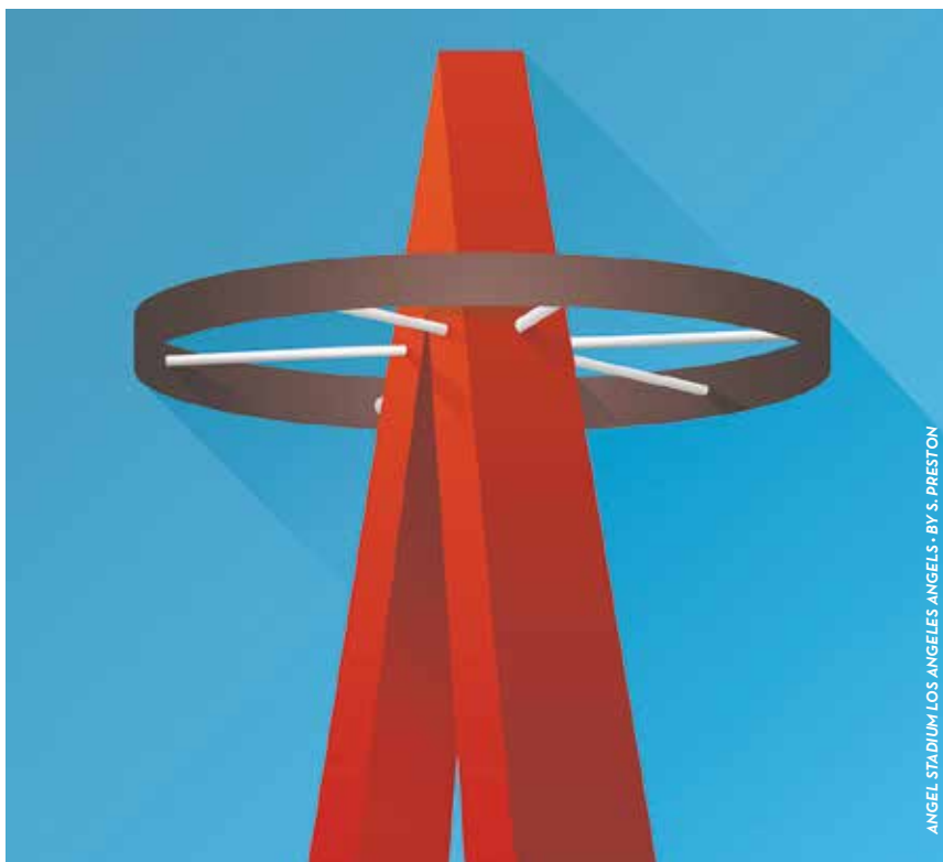
ANGEL STADIUM LOS ANGELES ANGELS

"One of my favorite exhibitions here was "Walt and the Flying Bull," featuring the Disney designed 'Flying Bull' logo for the Marine Corps Air Station El Toro, along with other designs that supported the World War II effort. Another favorite