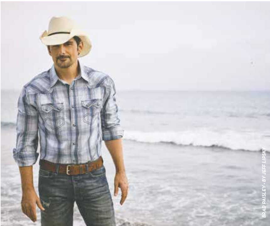
BRAD PAISLEY

FivePoint Amphitheatre, 14800 Chinon, Irvine.