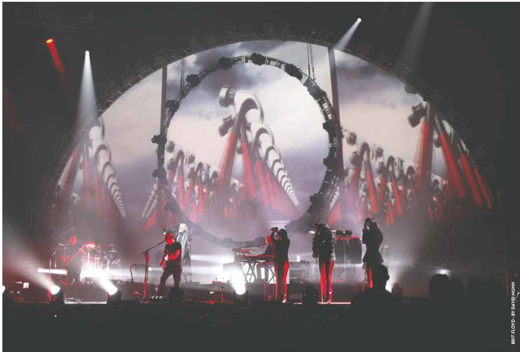
BRIT FLOYD •