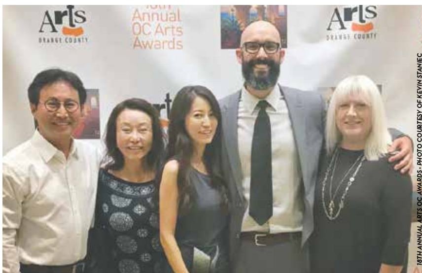
18TH ANNUAL ARTS OC AWARDS •

"MY WIFE AND I MET AFTER A BOOK RELEASE PARTY. WE HAVE STARTED PUBLISHING COMPANIES TOGETHER AND CO-FOUNDED A NONPROFIT ORGANIZATION IN OUR COMMUNITY. WE ARE BOTH VERY PASSIONATE ABOUT SUPPORTING CREATIVE AND CULTURAL OPPORTUNITIES IN ORANGE COUNTY."