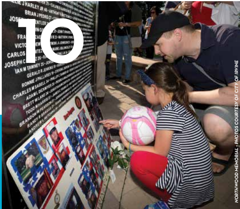
NORTHWOOD MEMORIAL