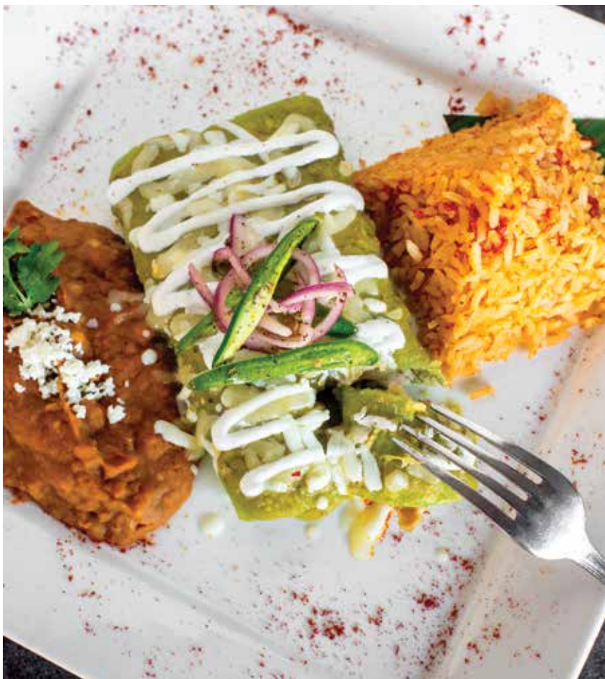
ENCHILADAS DE MEXICO CITY FROM TACO ROSA • PHOTO COURTESY OUTSHINE PR

ing is the newest addition to TRADE Food Hall, Broken Rice, which first opened its doors back in March. The Vietnamese eatery first started as a popular Orange County and Los Angeles food truck. Serving classic Vietnamese staples, Broken Rice uses the textures and taste elements of its namesake, which are fragments of rice grains, and allows customers the opportunity to build the meal by adding combinations of veggies, proteins and handcrafted sauces such as sriracha BBQ, miso curry, peanut sesame or cilantro lime. The TRADE location offers two new options: crispy glazed salmon and cajun shrimp, in addition to the food truck's original offerings of chicken, beef and tofu.