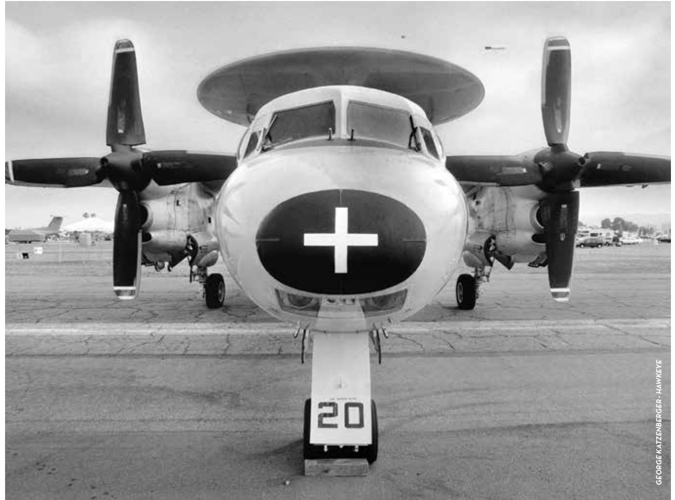
GEORGE KATZENBERGER - HAWKEYE

The artist's 1996 "Hail and Farewell" displays an F4U Corsair and F/A-18 Hornet flying over a landscape, with a sunrise and sunset as the backdrop. Along with flags and marine emblems