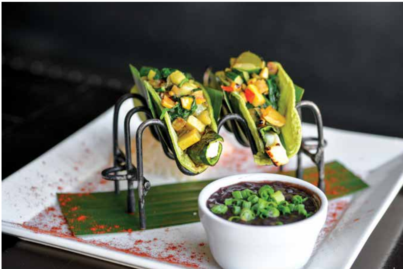
CHILE RELLENO TACOS FROM TACO ROSA