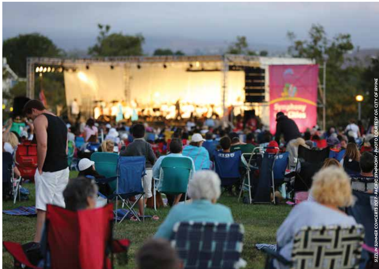
SIZZLIN SUMMER CONCERTS 2017 - PACIFIC SYMPHONY

FivePoint Amphitheatre, 14800 Chinon, Irvine.