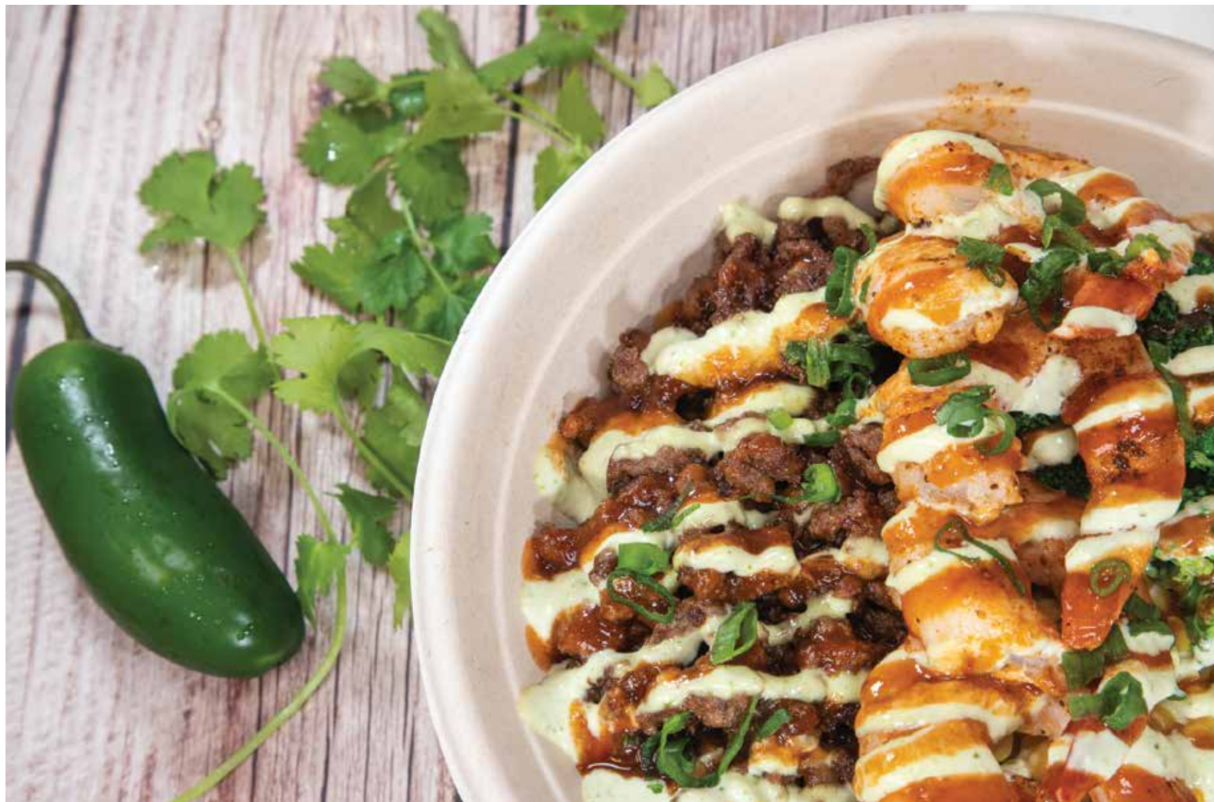
SURF N TURF