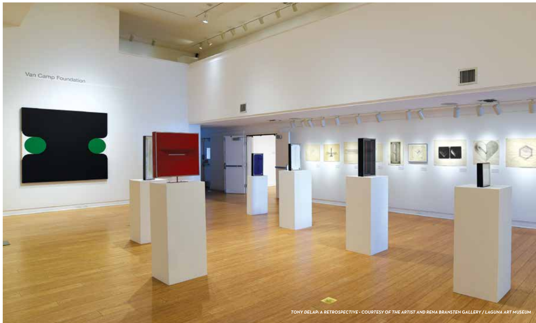
TONY DELAP: A RETROSPECTIVE - COURTESY OF THE ARTIST AND RENA BRANSTEN GALLERY / LAGUNA ART MUSEUM