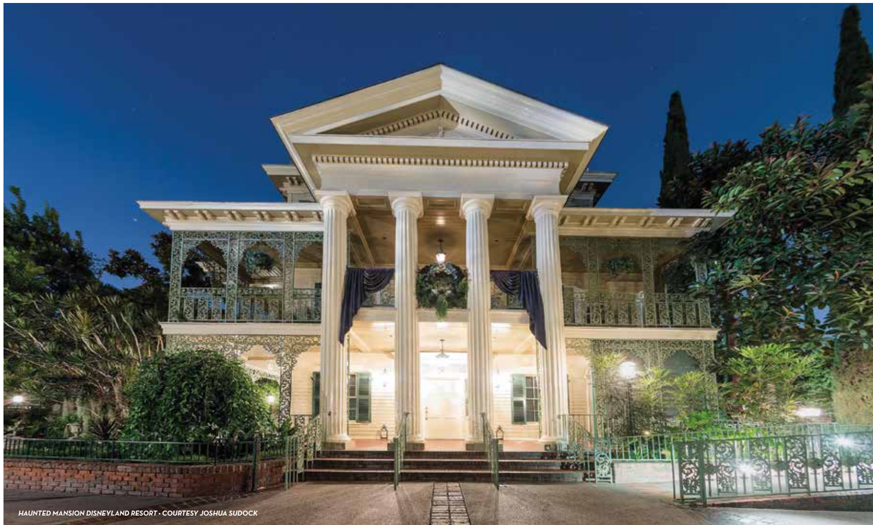
HAUNTED MANSION DISNEYLAND RESORT