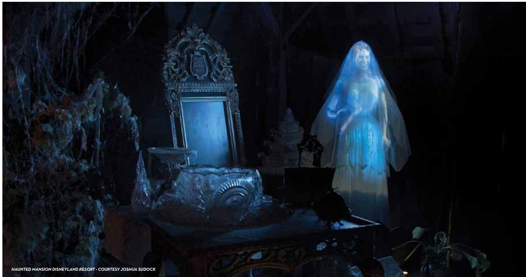
HAUNTED MANSION DISNEYLAND RESORT