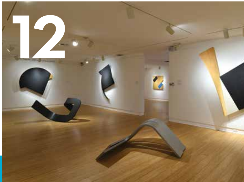
TONY DELAP: A RETROSPECTIVE · COURTESY OF THE ARTIST AND RENA BRANSTEN GALLERY / LAGUNA ART MUSEUM