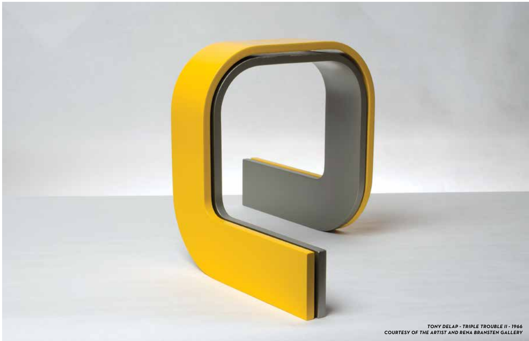
TONY DELAP - TRIPLE TROUBLE II - 1966