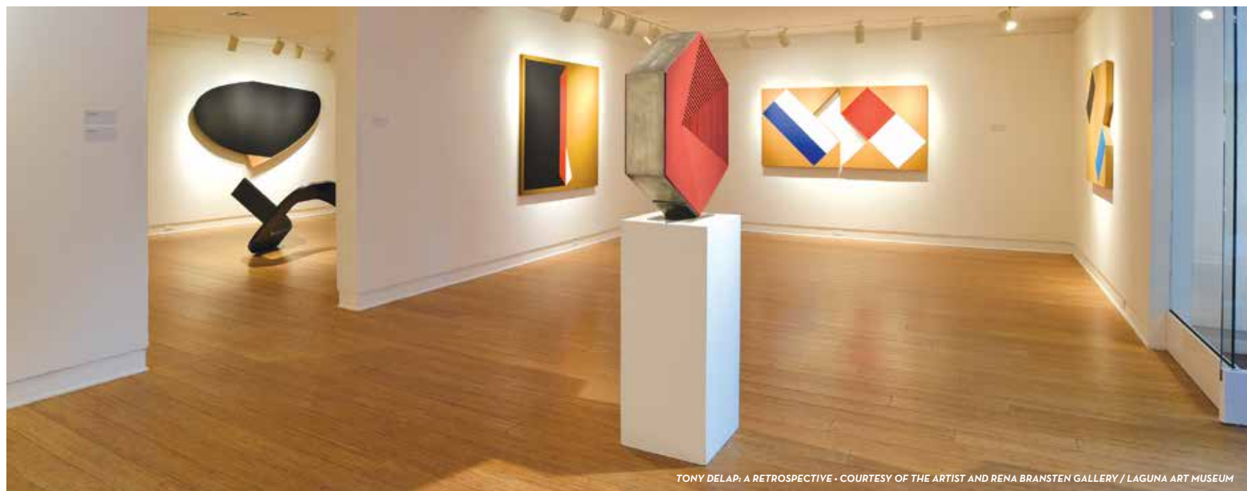
TONY DELAP: A RETROSPECTIVE • COURTESY OF THE ARTIST AND RENA BRANSTEN GALLERY / LAGUNA ART MUSEUM