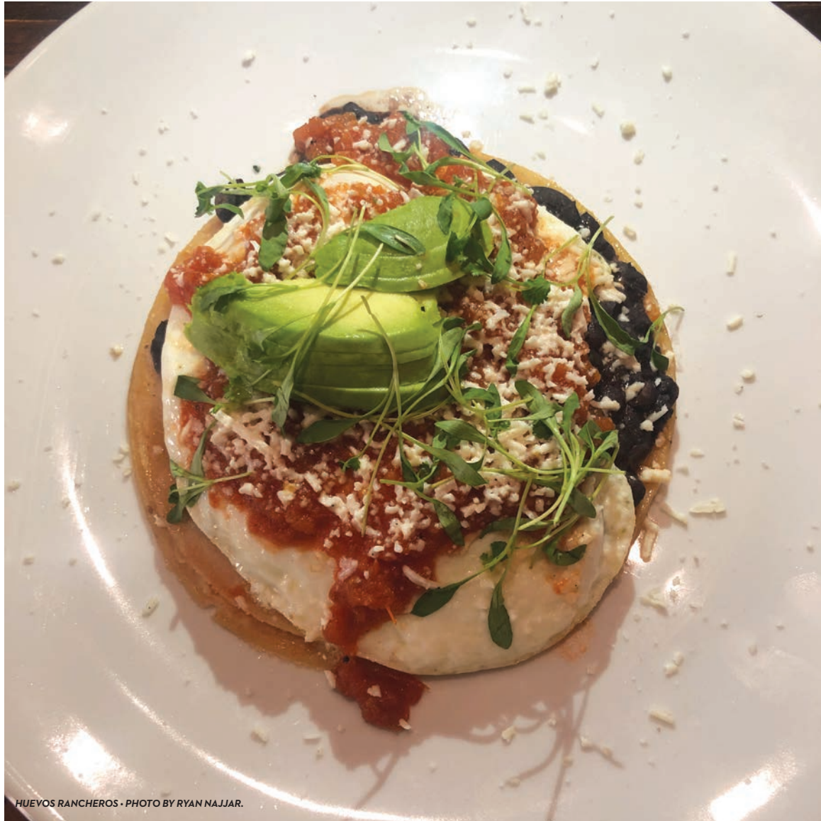
HUEVOS RANCHEROS