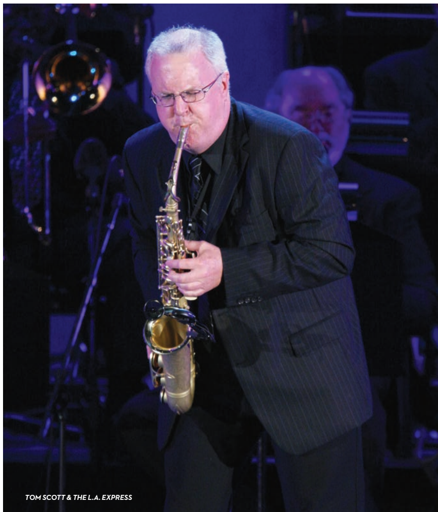
TOM SCOTT &amp; THE L.A. EXPRESS