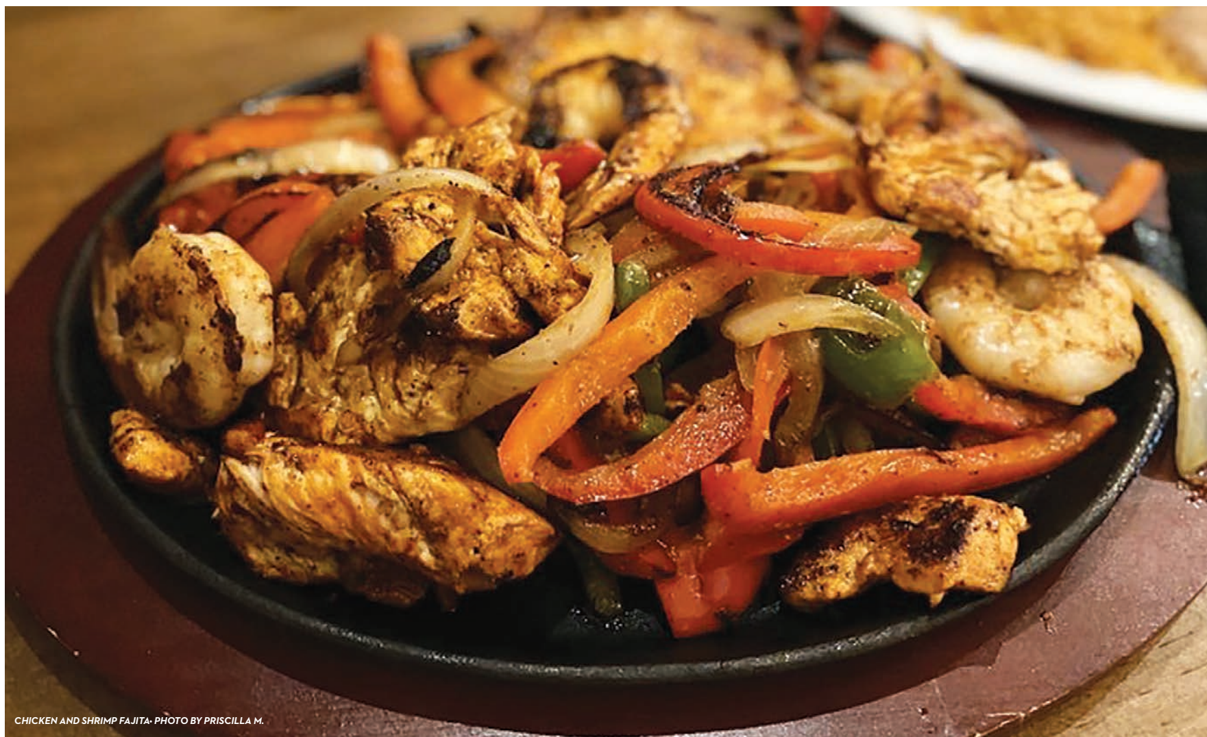
CHICKEN AND SHRIMP FAJITA.

dishes like esquites – roasted corn with cotija cheese and poblano peppers – and even handmade sopes. For those wanting some ethnic fusion, there's also a Mexican pizza, which you can get topped with carnitas, beef asada, refried beans, ranchero sauce and more.