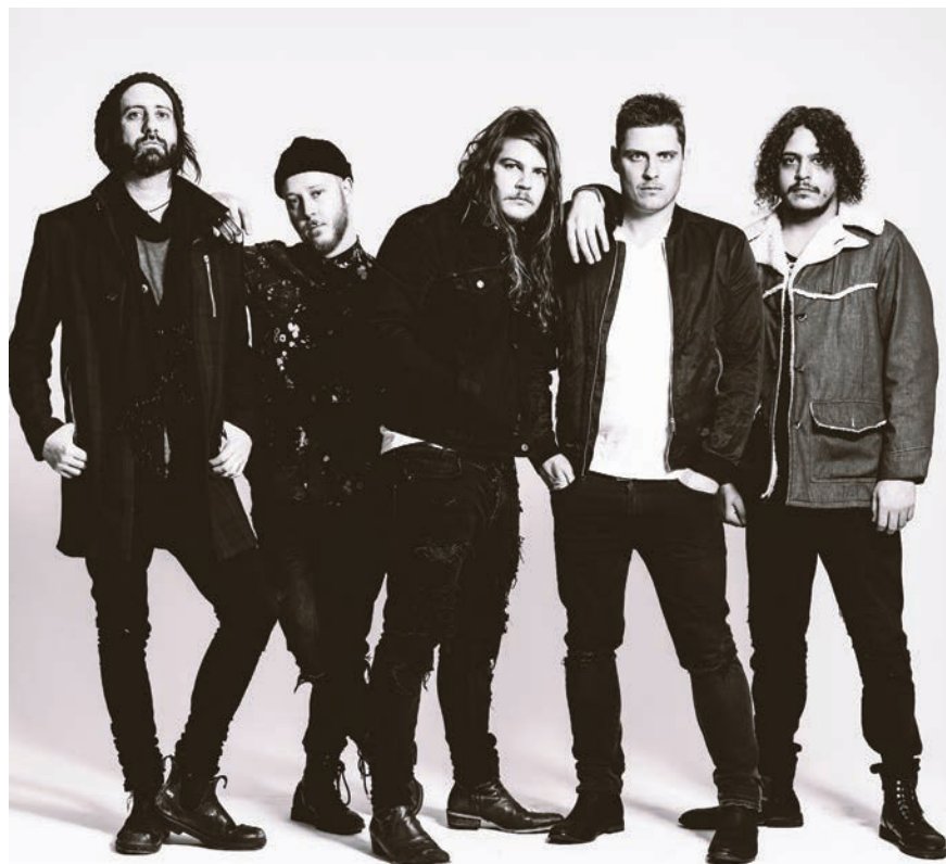
"THE GLORIOUS SONS"