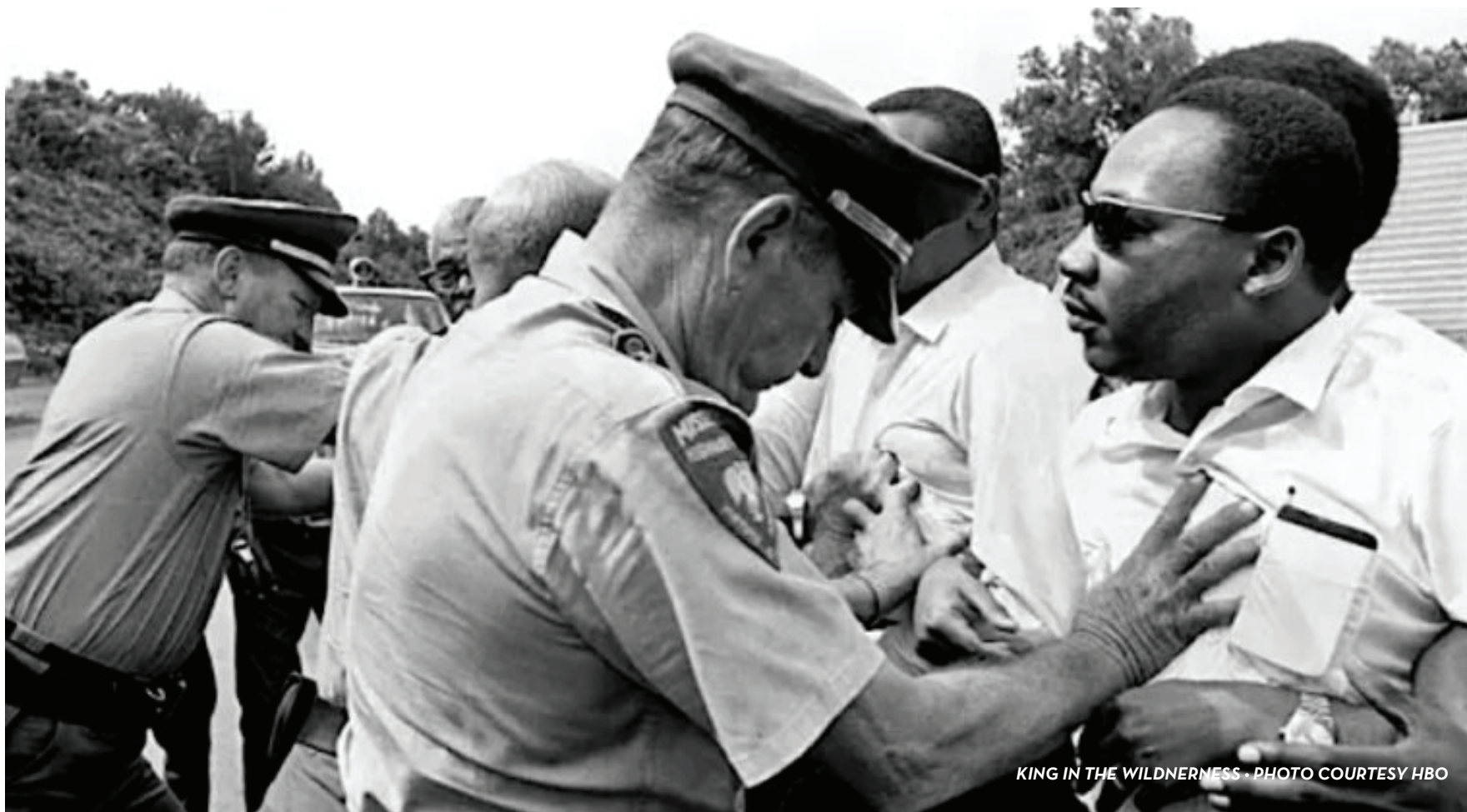
KING IN THE WILDERNESS