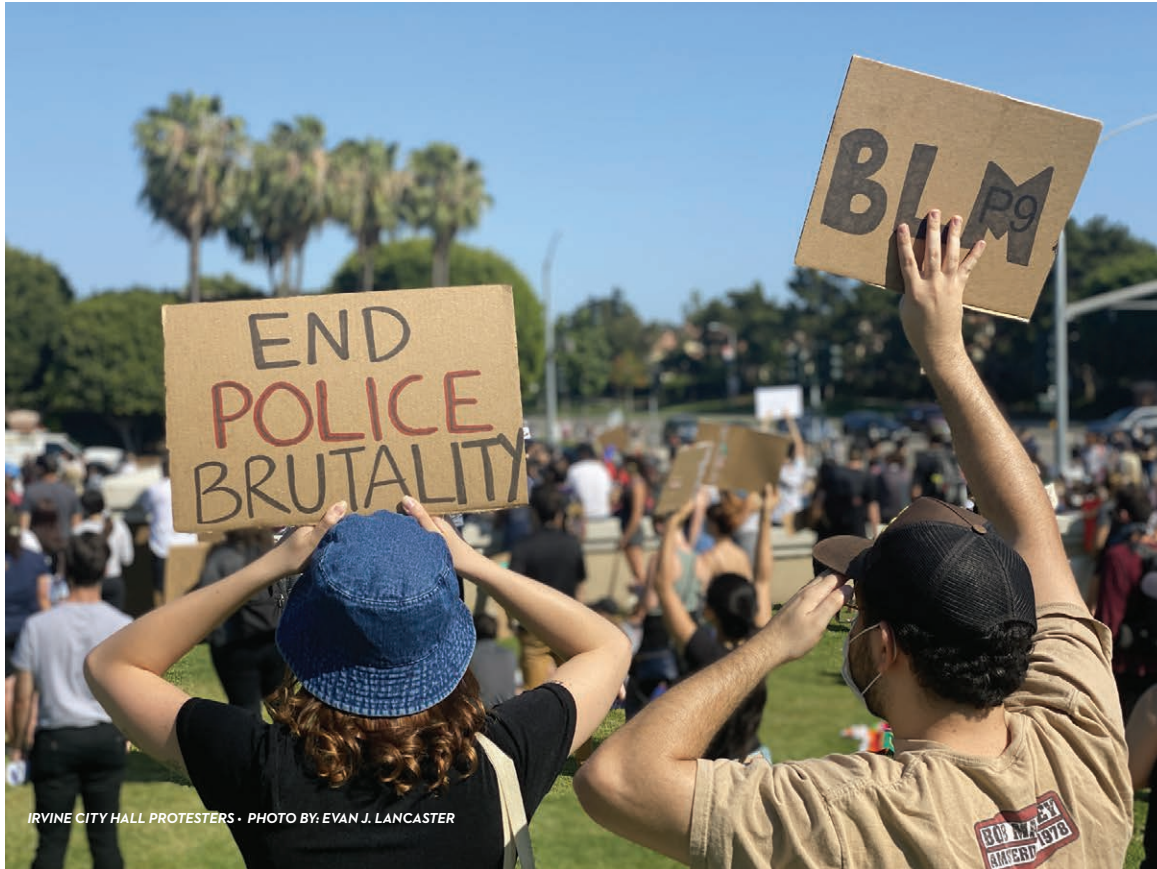
IRVINE CITY HALL PROTESTERS • PHOTO BY: EVAN J. LANCASTER