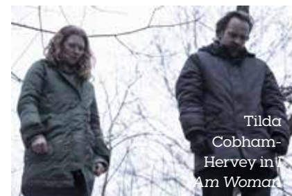
Tilda Cobham-Hervey in Am Woman

How far would you go to protect your child? This is the question at the heart of Veena Sud's thriller, The Lie . When Kayla (Joey King) confesses to her parents Jay (Peter Sarsgaard) and Rebecca (Mireille Enos) that she pushed her best friend off a bridge to her death, they're forced into morally corrupted territory few suburban parents have navigated. The titular "lie" not only refers to the heart of the mystery, but the refusal to