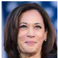
SENATOR KAMALA HARRIS