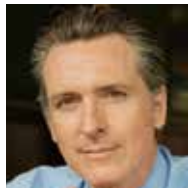
GOVERNOR GAVIN NEWSOM