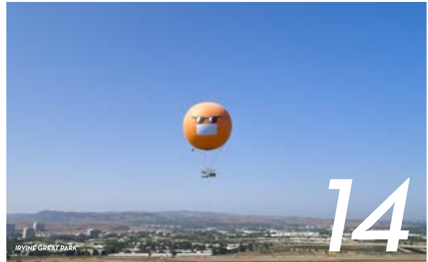
IRVINE GREAT PARK

FOR ALL INQUIRIES: PUBLISHER@IRVINEWEEKLY.COM