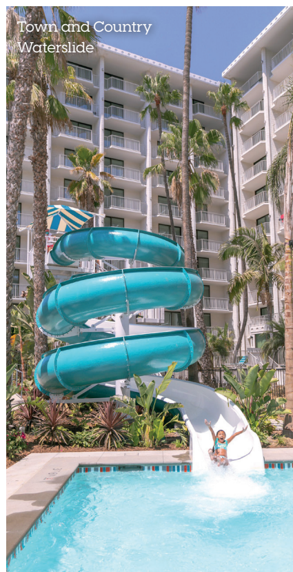
Town and Country Waterslide

Honky tonk women and men should head to Moonshine Flats ( moonshineflats.com ) where dancing cages, spinning chairs and beer pong provide a head-spinning good time. SD tourism has been marketing towards the bachelor/ette crowd as of late and this party hub is tops (there's a celebration guest list on their website that waives bridal groups' cover charges).