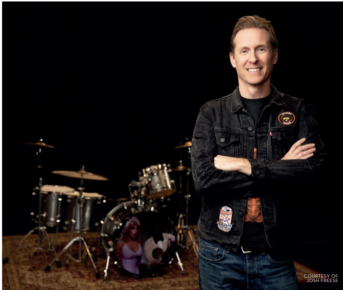
COURTESY OF JOSH FREESE

Long Beach-based drummer Josh Freese may well be the busiest man in music. The list of bands he's played with is a veritable who's who of contemporary rock: Weezer, A Perfect Circle, Sublime (with Rome), Nine Inch Nails and Guns N' Roses are just a few highlights of a list that's as long as your arm. He's not a one-trick pony either; he's also performed on albums by pop artists such as Kelly Clarkson, Katy Perry and Miley Cyrus. Nowadays, he's working with Devo and Sting, he's filling in with the Offspring, and of course, he's forever a member of his first love, punk band the Vandals.