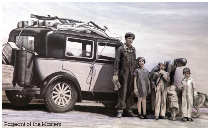
Pageant of the Masters

I t's happening. The world-renowned Festival of Arts and Pageant of the Masters will reopen this summer on July 5 and 7 respectively, with both festivals running through September 3.