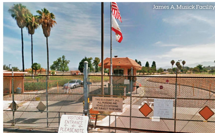
James A. Musick Facility

As a man was buying donuts for his golfing buddies at the Irvine-based Donut Star, a man wearing a camouflage cowboy hat and a black jacket and sunglasses walked up behind him and pulled out a gun. The suspect can be seen pointing the gun directly at the